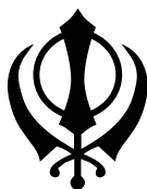
Deg Teg Fateh

"Deg-O-Teg O Fateh-Nusrat-I -Bedrang Yafat -Az Nanak--Guru Gobind Singh" i.e, "The kettle ( Deg )- (The Sikh symbol of economy, the means to feed all and sundry on an egalitarian base), sword ( Teg )-(The Sikh symbol of power, to protect the weak and hapless and smite the oppressor), victory and unending patronage are obtained from Gurus Nanak-- Gobind Singh ". After Banda Singh this inscription was adopted by the Sikh Misals and then by Sikh rulers for their coins also. Now the official seal of Akal Takhat bears this inscription.