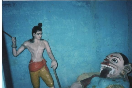
Hindu Mandir at Panchvati Lakshman attacking Sarup Nakha