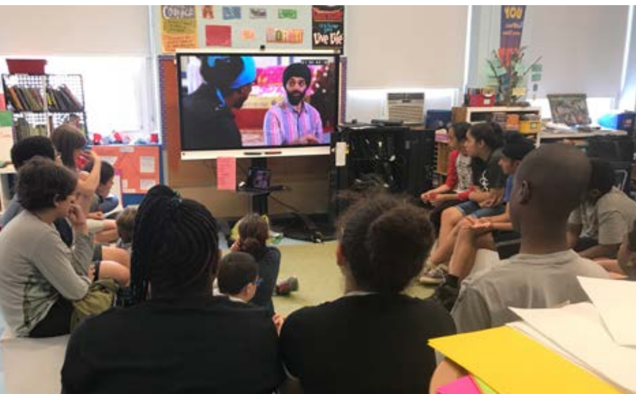
Above: High school students participate in an anti-bullying workshop in California

Website: www.sikhcoalition.org/educators