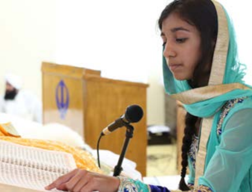
Above: A Sikh girl reading from the Guru Granth Sahib during her Charni Lagna ceremony.