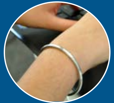
KARA steel or iron bracelet