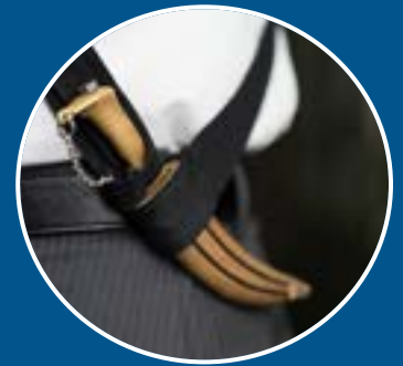
KIRPAN religious article resembling a knife