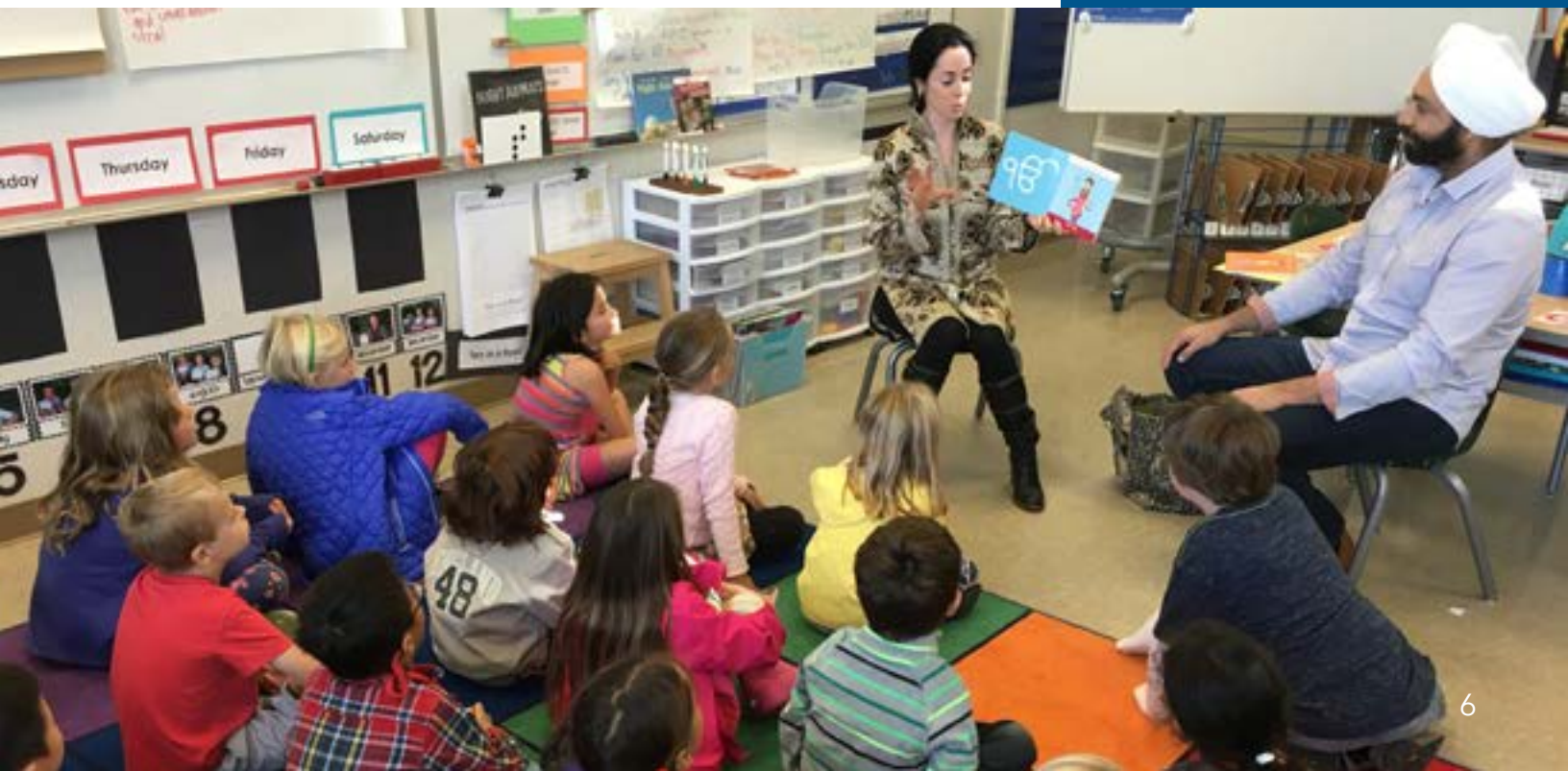
Students read Sikh children's book