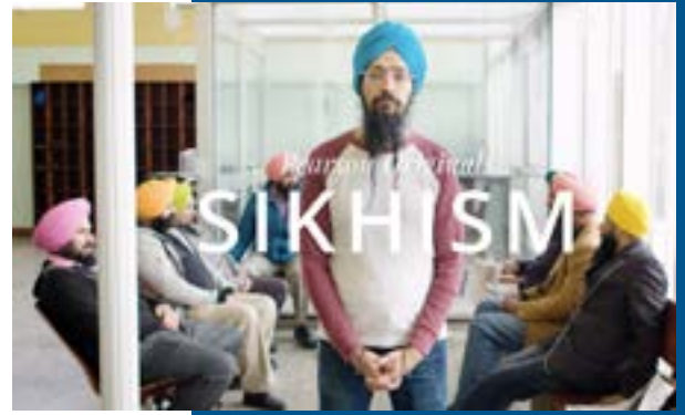
Educational video made for Pearson and produced by Blue Chalk Media