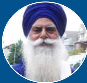
KESH unshorn hair

A turban is a long piece of cloth tied over uncut hair that signifies equality and sovereignty. Turbans can be worn by men and women, though men wear them more often.