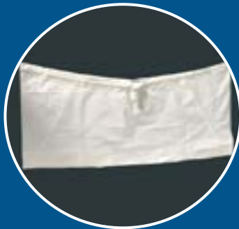
KACHERA slightly longer type of underpants