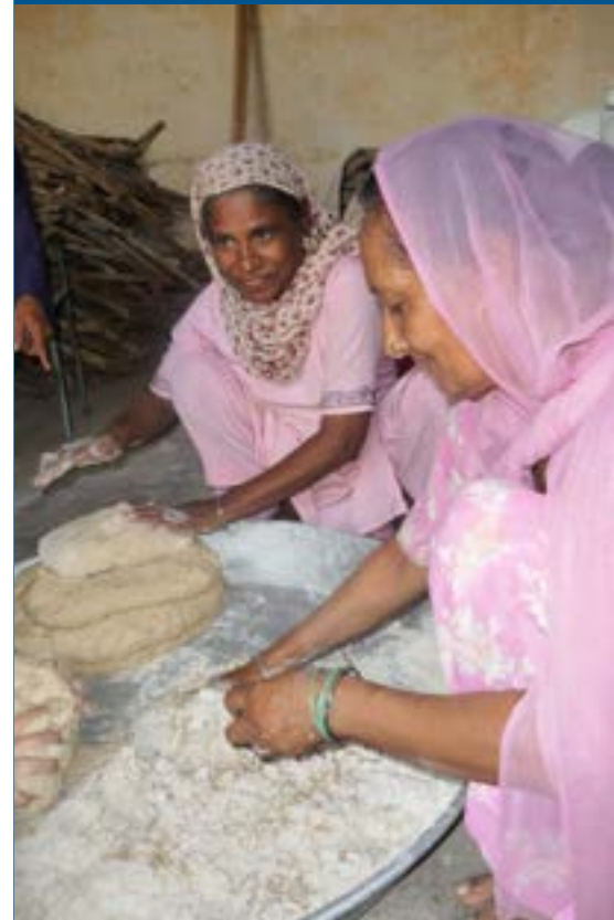
Above: Inside of a Sikh gurdwara in Bridgewater, N.J.

At the end of the worship service, congregants break bread together through the institution of langar , a free community meal open to all. The Sikh langar has long been patronized by people of various backgrounds seeking food. Today, Sikhs have taken langar outside the gurdwara and into communities in need, from underserved populations in the United States to various refugee camps around the world.