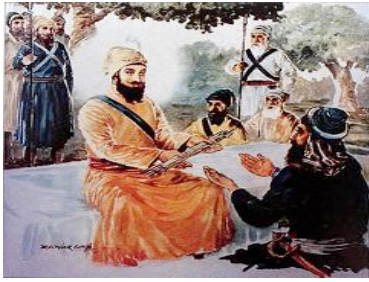
Banda Singh Bahadur receiving command of the Khalsa army from Guru Gobind Singh.