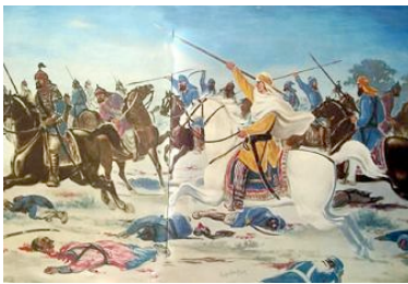
(Mai Bhag Kaur leading the Sikhs at the battle of Muktsar.)

The last battle of Muktsar was fought with the pursuing Mughal army on the way to Damdama Sahib (Sabo ki Talwandi) where the Guru stayed for 9 months and established a Sikh centre for learning.