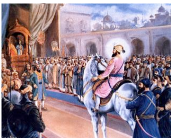
Emperor Bahadur Shah receiving Guru Gobind Singh (1707)

The Guru started from Damdama travelling southwards. Aurangzeb died in Ahmednagar on February 20th, 1707. In the war of succession, as requested by prince Muazzam (later Bahadur Shah), the Guru sent a small force of selected warrior Sikhs to support the prince. He had promised the Guru to be a just ruler. Bahadur Shah succeeded to the throne and invited Guru Gobind Singh to his coronation. He received the Guru with great respect and presented him with a robe of honour and a jewelled scarf ( dhukhdhukhi ).